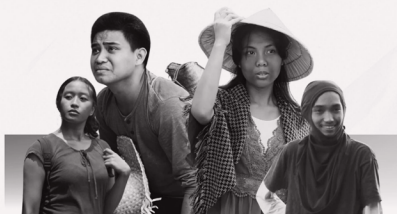
PELIKULANG AGRARYO 2025 LIST OF WINNERS (ARB & ARBO)

Comm students' 'Punla' is Pelikulang Agraryo 2025 CL Best Film