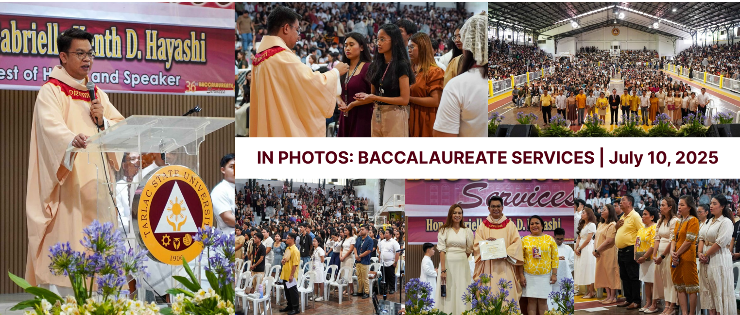
IN PHOTOS: BACCALAUREATE SERVICES | July 10, 2025