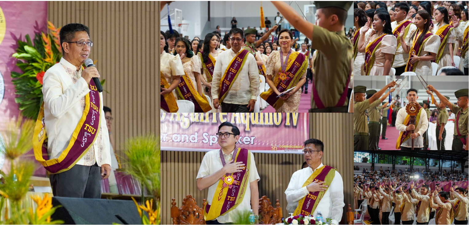
IN PHOTOS: 36 th COMMENCEMENT EXERCISES | July 11-18, 2025

Last July 13, before the launch, OMIS developers conducted an orientation with TSU NASA officers on using MAMS.